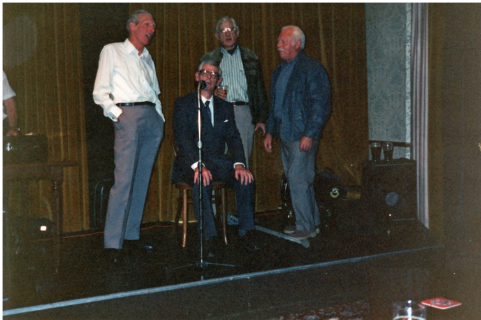
This photograph is not captioned, but it must be a different show (unless they changed stage kit ...) from the same era.